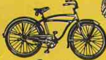
BOYS' OR GIRLS' BICYCLE